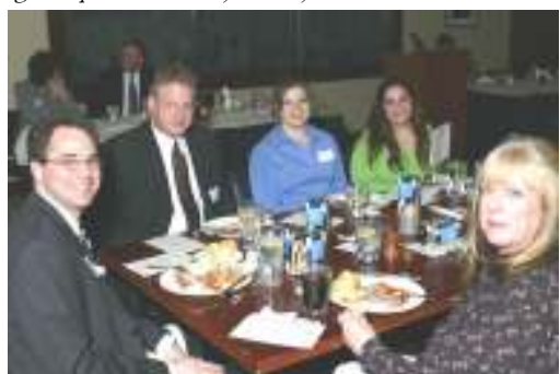
Guests of Triangle Tech, Platinum Sponsors for the Governor's Luncheon