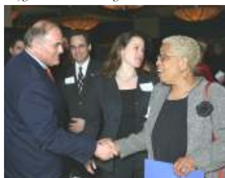
Governor Rendell greet Billie Terry, North Side Coalition for Fair Housing.