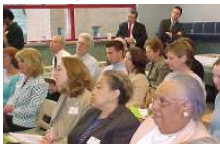
Attendees at the Mayoral Candidate Forum.