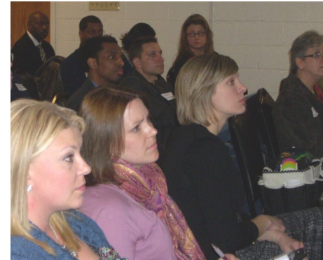
Attendees listen intently at the Rivers Casino Program. A question and answer period followed the presentation.